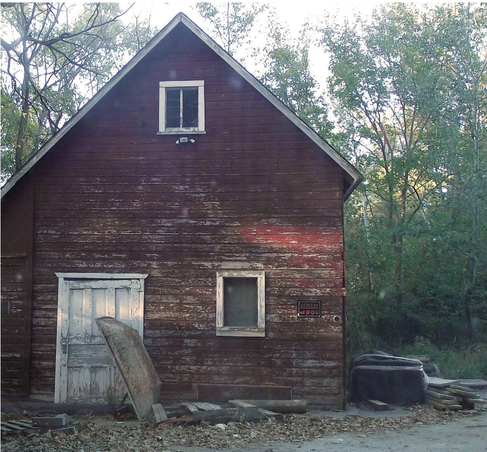
The Morping Staircase at Hummel Park leads to this rickety old shelter. Inside this shelter resides evidence of devil worship and cult rituals through markings all over the walls.